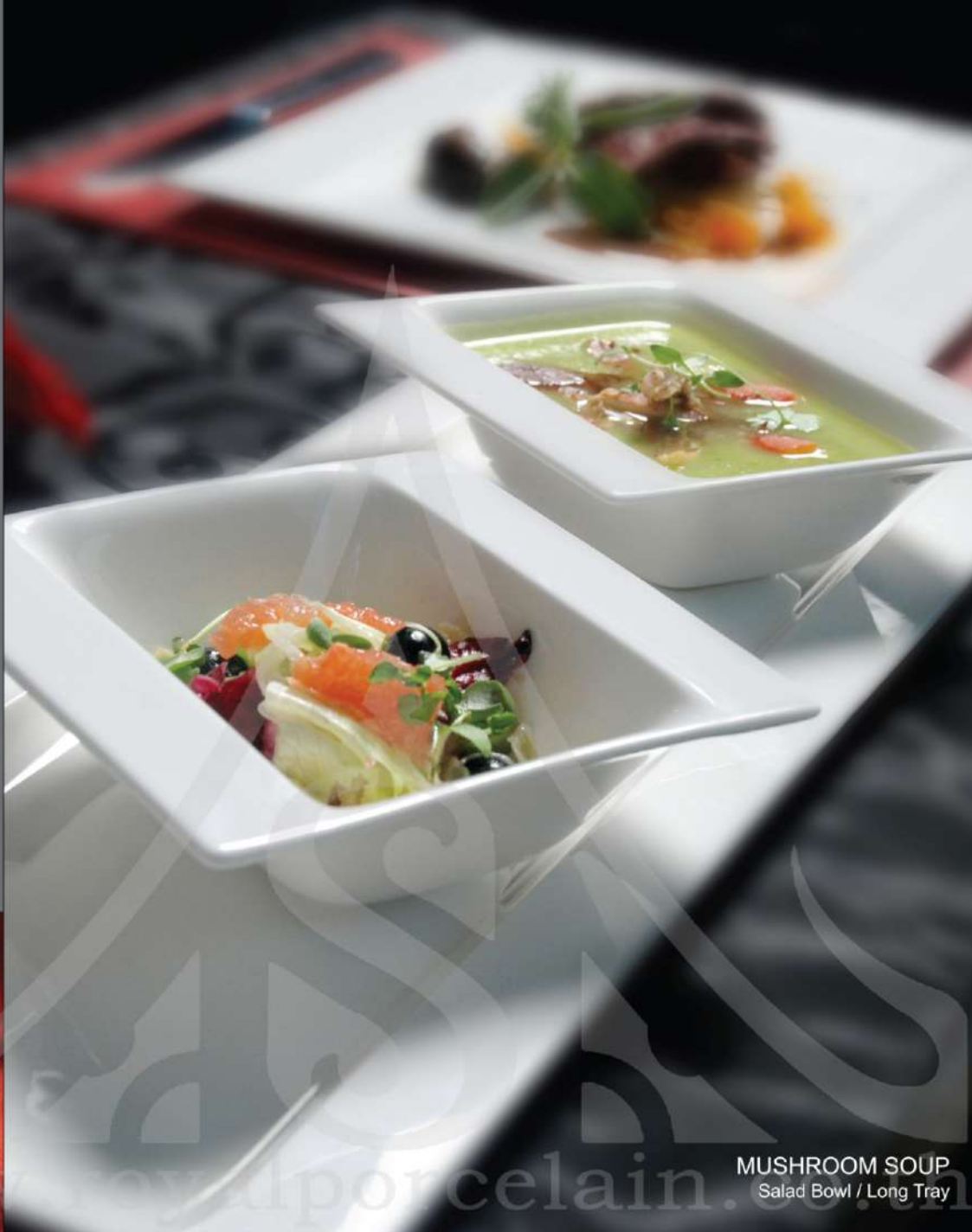
MUSHROOM SOUP Salad Bowl / Long Tray