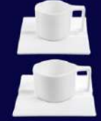
COFFEE CUP STACKABLE N 5636 0.28 ltr. (9.86 oz.) 206 g. N 5637 0.22 ltr. (7.74 oz.) 176 g. SQUARE SAUCER (OPENED WELL) N 5639 15.0 X 15.0 cm. (5 7/8" X 5 7/8") 234 g.