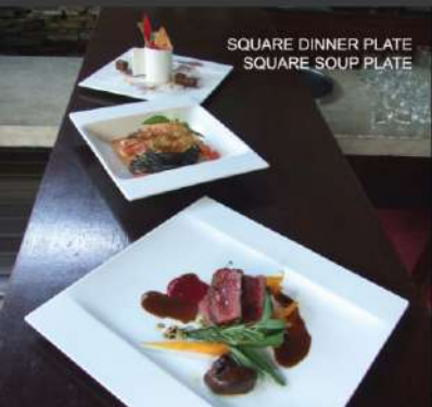
SQUARE DINNER PLATE SQUARE SOUP PLATE