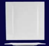
SQUARE DINNER PLATE N 5601 27.0 X 27.0 cm. (10 5/8" X 10 5/8") 894 g.