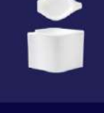
JAM POT COVER / CANAPE DISH N 5633 L 6.5 X 10.0 cm. (2 1/2" X 4") 43 g. JAM POT / OPEN SUGAR BOWL N 5633 0.25 ltr. (8.80 oz.) 191 g.