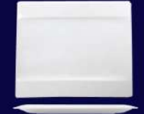
RECTANGULAR DINNER PLATE N 5646 27.0 X 31.5 cm. (10 5/8" X 12 3/8") 977 g.