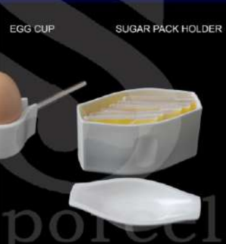
EGG CUP SUGAR PACK HOLDER