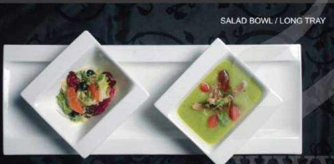
SALAD BOWL / LONG TRAY