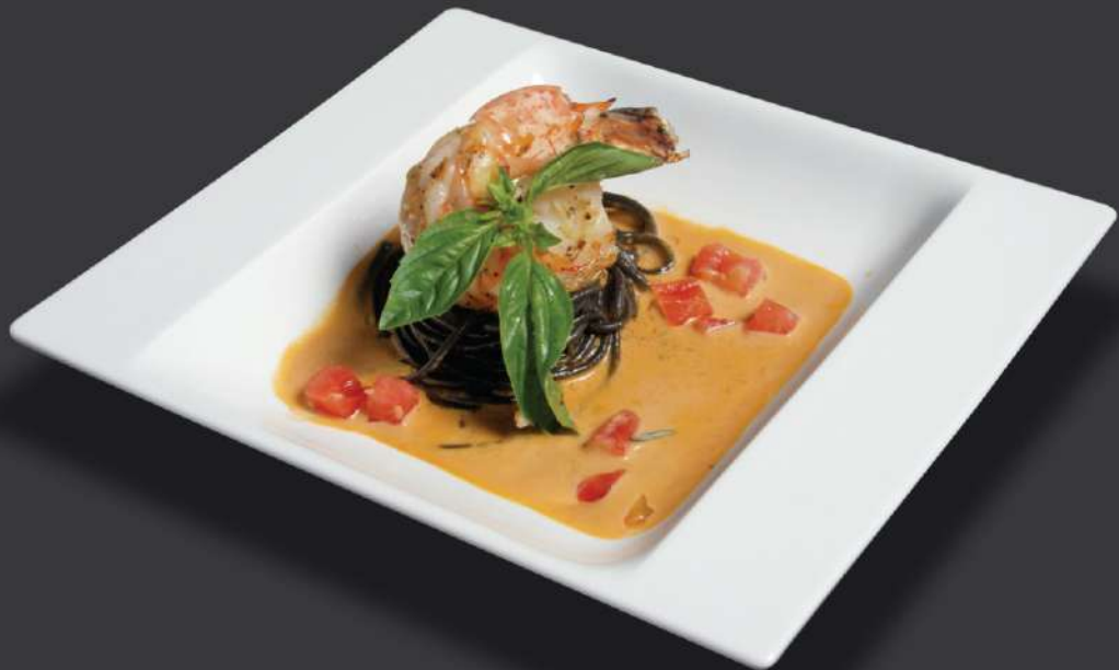
SPAGHETTI LOBSTER Square Salad Plate