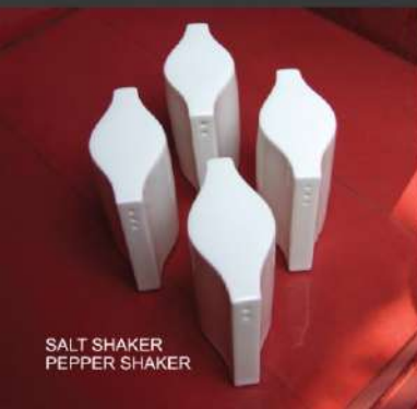
SALT SHAKER PEPPER SHAKER