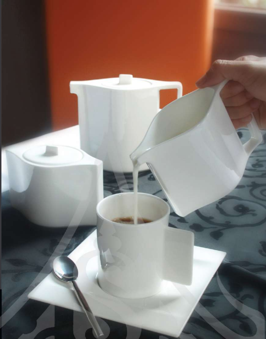
COFFEE SET Coffee Pot With Lid Coffee Cup / Coffee Cup Saucer Sugar Bowl With Lid / Creamer