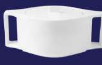
SOUP TUREEN WITH LID N 5621/L 3.35 ltr. (117.92 oz.) 1,868 g.