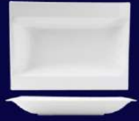
RECTANGULAR DEEP PLATTER N 5610 28.5 X 40.0 cm. (11 1/4" X 15 3/4") 1,790 g.