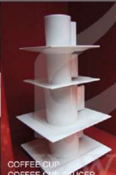
COFFEE CUP COFFEE CUP SAUCER