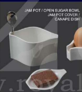
JAM POT / OPEN SUGAR BOWL JAM POT COVER / CANAPE DISH