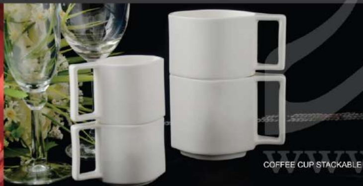
COFFEE CUP STACKABLE