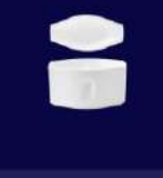
SUGAR PACK HOLDER N 5631 5.5 X 11.5 cm. (2 1/8" X 4 1/2") 180 g.