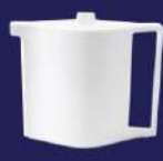
COFFEE POT WITH LID N 5615/L 1.10 ltr. (38.72 oz.) 913 g. N 5616/L 0.48 ltr. (16.90 oz.) 474 g.