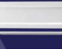
LONG TRAY N 5627 17.5 X 47.5 cm. (6 7/8" X 18 3/4") 1,005 g.