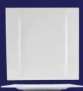
SQUARE PLATTER N 5811 31.5 X 31.5 cm. (12 3/8" X 12 3/8") 1,235 g.