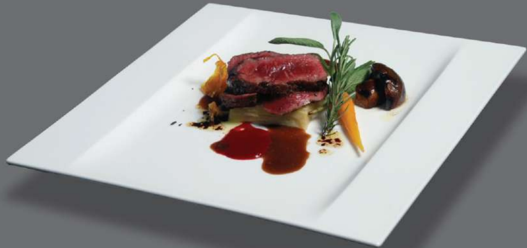
BEEF STRIPLIN Square Platter