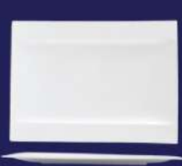
RECTANGULAR PLATTER N 5608 29.0 X 40.0 cm. (11 3/8" X 15 3/4") 1,494 g.