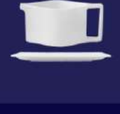
GRAVY BOAT N 5628 0.34 ltr. (11.96 oz.) 397 g. GRAVY BOAT STAND N 5612 14.5 X 23.0 cm. (5 3/4" X 9") 332 g.