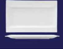
RECTANGULAR PLATE N 5609 19.0 X 30.5 cm. (7 1/2" X 11 7/8") 676 g.