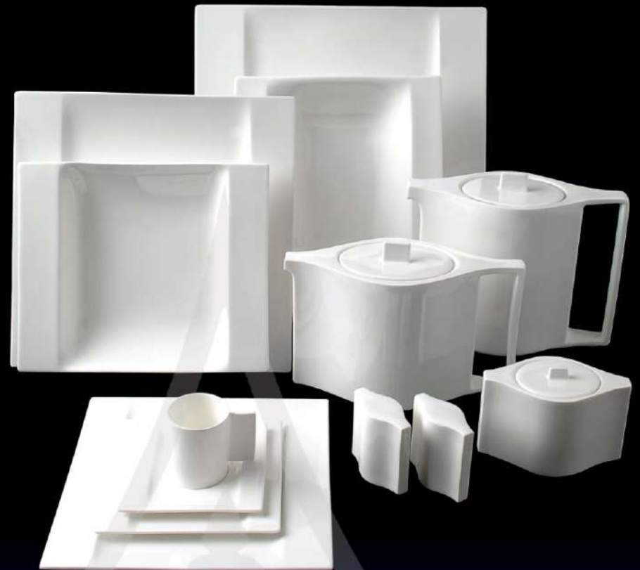
Shape : PRIME